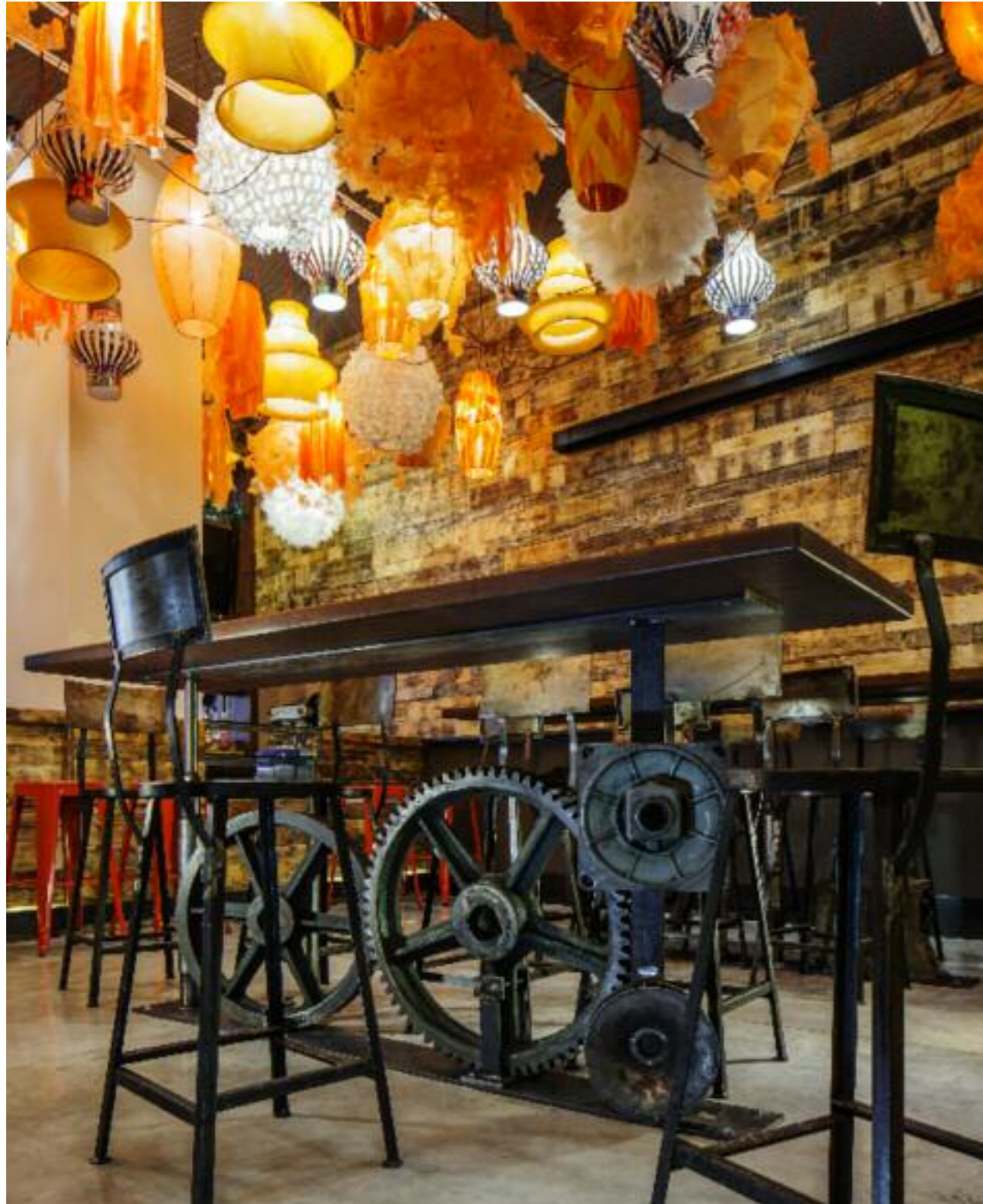
Situated in Barcelona's Gràcia district, is the latest by The Design Agency. Not only was the Generator Barcelona Hostel building renovated, but also the revitalization of the Generator brand. The interiors of the 1960's office building has been completely gutted and rebuilt in a way that demonstrates the tremendous creativity that is being invested in this brand and in each location. The Design Agency has collaborated with local architects, suppliers and artists, creating unique super-graphics, fantastic, unusual light fixtures and signature "G" sculptures.