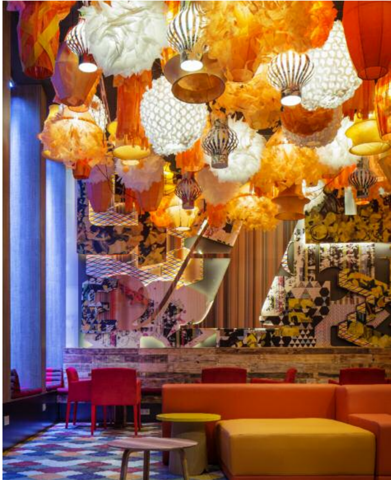
As a flagship, Generator Barcelona combines both a hostel and a hotel. Similar to Barcelona itself, its interiors are a tapestry of layers and styles. Entry through its main doors to the left leads guests to the warm and energetic hotel lobby and a rear bar with a vibrant mix of textures and patterns including ornate Hungarian concrete floor tiles and earthy raw metals and woods, over which float 300 plus lanterns inspired by Barcelona's annual Festa Major de Gràcia by local artist, Julie Plottier. To the right of the entry is the hostel lobby with an internal pavilion that was inspired by Barcelona's nautical history.